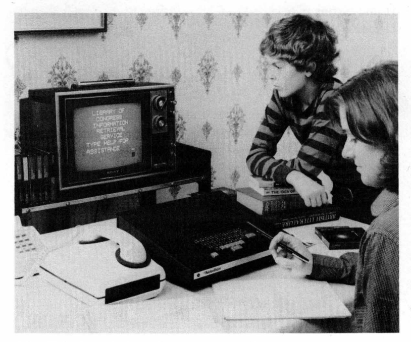
The VideoBrain's Timeshare program allows communication with other computers.

■ VideoBrain—In 1978 the VideoBrain became the first home computer system sold in department stores. Advertised with the slogan "now you don't have to leave your brains at the office," the $500 VideoBrain drew the greatest response for a new product in the history of Macy's in New York and San Francisco.